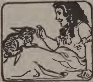
He Bounded on the Bed.

“ B UNNY RABBIT was very young. He’d only just left home. His mother had been caught in a horrid, cruel trap and had been killed. So Bunny was left all alone. His daddy didn’t care for such a little, ugly black and white rabbit, and his brothers and sisters considered themselves too grown up for him,” daddy began.